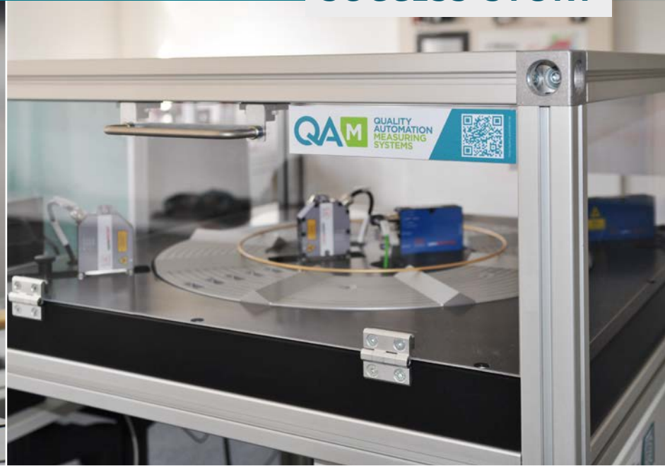
Core ring – measuring height, measuring system