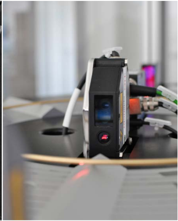
left: construction, right: fillet measuring

electrical installation and software development of the system. A Beckhoff drive consisting of a servo motor and gear was used to drive the turntable. The control was implemented on a Beckhoff IPC with Beckhoff TwinCAT 3. A MicroEpsilon laser micrometer for measuring the height and two laser displacement sensors for recording the inner and outer radius were used to scan the core ring with an accuracy of 10 \mu\text{m} . The recorded data points are linked to the position data in the controller and saved as a CSV file. A MATLAB script was developed in parallel to the actual system control, which is started in the process by the control. The script reads in the exported data and takes over the complex calculations of the minimum, medium and maximum radius, the optical diameter, the circumference, the roundness and deformation. The results are stored in various files and read in by the Beckhoff control. The results are clearly displayed to the operator as values and as graphics on the panel surface.