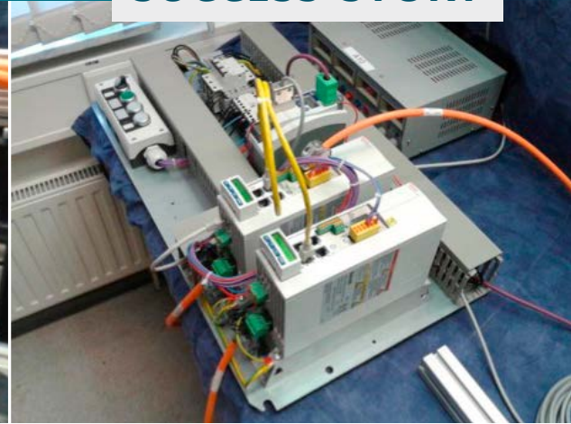
Built-up of test bench